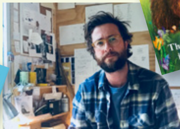
Teddy Keen Journey to the Lost River 7-12yrs 12-1pm | £6 | Bear Pit Theatre

We're celebrating 50 years of Roger Hargreaves' wonderful little characters who have been enjoyed by so many children over the years. There's a Mr Man or Little Miss for everyone! Come and colour and create your own Mr Men and Little Miss world.