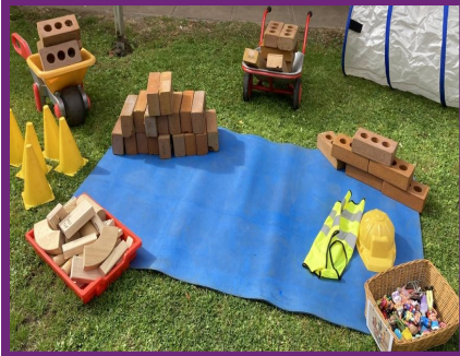
RUGBY August 2021

"M... loved the painting activities the most."